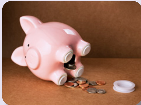
When it comes to home HVAC maintenance, falling for common myths may cost you in comfort and cash.