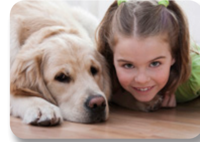
Pet dander is one of the most common indoor air allergens.

Your HVAC system's filter trap dust and other airborne pollutants as it's running. Make sure you use the highest-quality air filters that are compatible with your cooling system, and change them on a regular basis. When you're purchasing an air filter, consider the MERV rating (Minimum Efficiency Reporting Value). Higher-efficiency filters capture more airborne particulates — a great option for allergy sufferers. ■